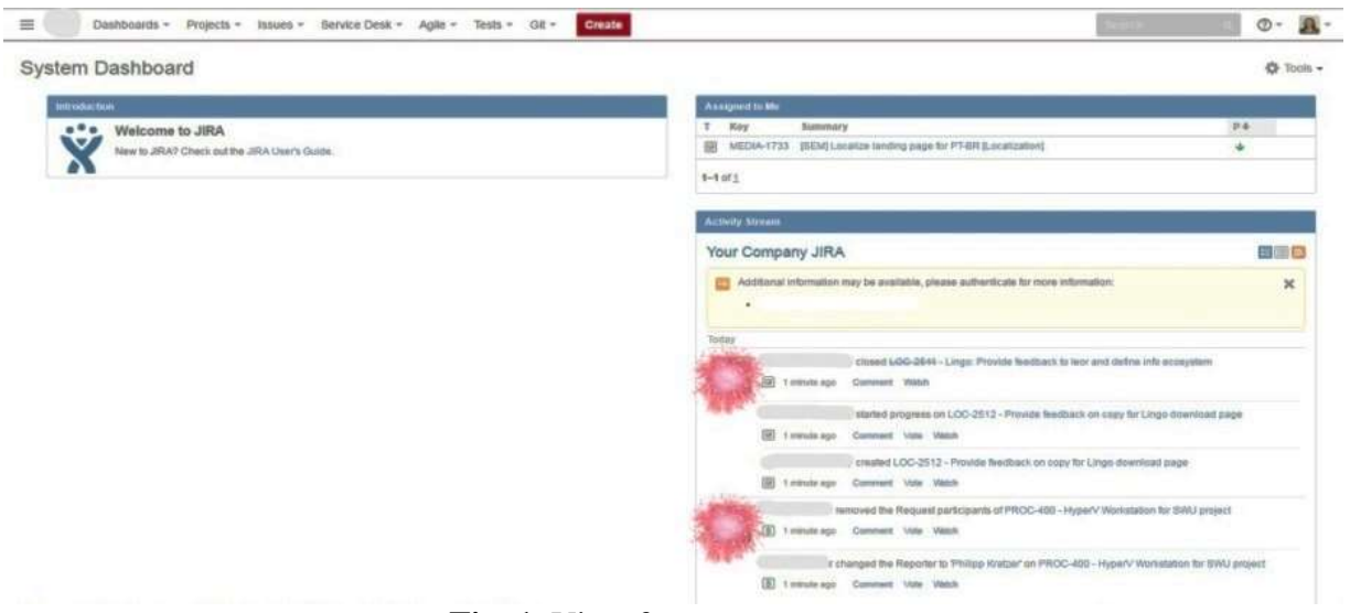
Fig. 1. View from user account

JIRA is helping prioritize the tasks, so the users can determine the estimated time for a project, score them by business value, and organize them into different categories. The communication is improved by the comments on tickets that are emailed to the person who created them, so it is easy to follow the conversation messages without having to schedule meetings or send emails. This quality of the tool will be given a 10 in term of quality of the management planning.